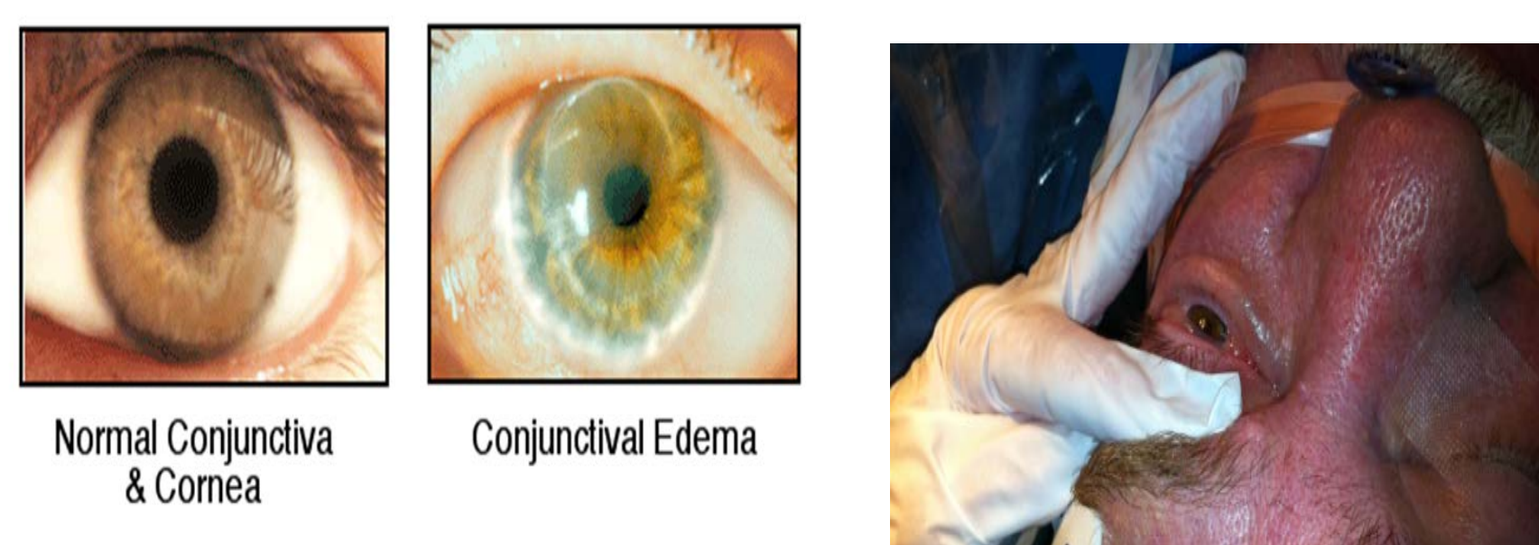
Normal Conjunctiva & Cornea Conjunctival Edema