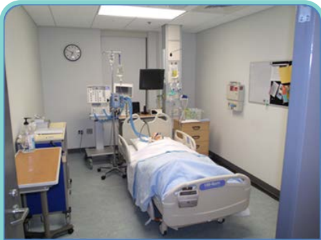
Intensive Care Unit