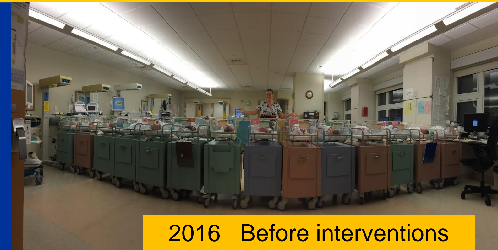
2016 Before interventions

MCH Project Development Supported by Sigma Theta Tau International, Johnson & Johnson and WellSpan Health