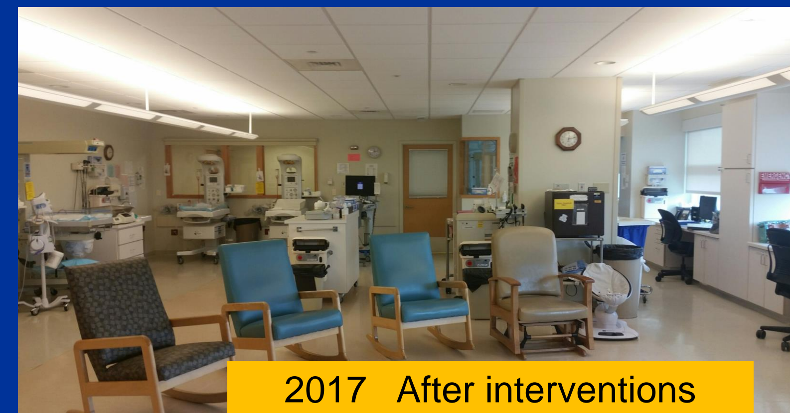
2017 After interventions