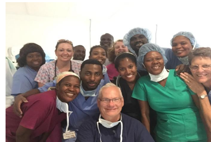
Study abroad team in La Gonave, Haiti