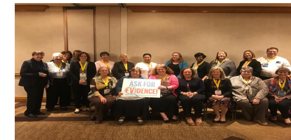
NONPF Health Policy Education Special Interest Group Inaugural Meeting, Washington, DC