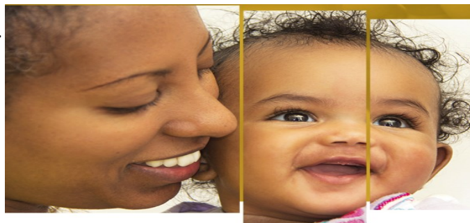
WOMEN WITH OBSTETRIC COMPLICATIONS TRANSFERRED TO SECONDARY AND TERTIARY INSTITUTIONS.

Data was collected from the informatics office at the hospital, it therefore analyzed at the perinatal meeting using the descriptive statistic, discussion was in between doctors and nurses, which was very fruitful and recommendations thereof was also in support of the establishment of the high care ward and strengthening of outreach services at primary health services. The high care ward started functioning in the late month of November 2016. There has been a noticeable improvement though more specialized equipment and skills are still needed to maximize its utilization.